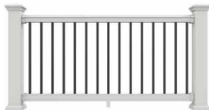
\frac{3}{4} " Black Round Aluminum Balusters