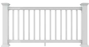
1 \frac{3}{8} " Square Balusters